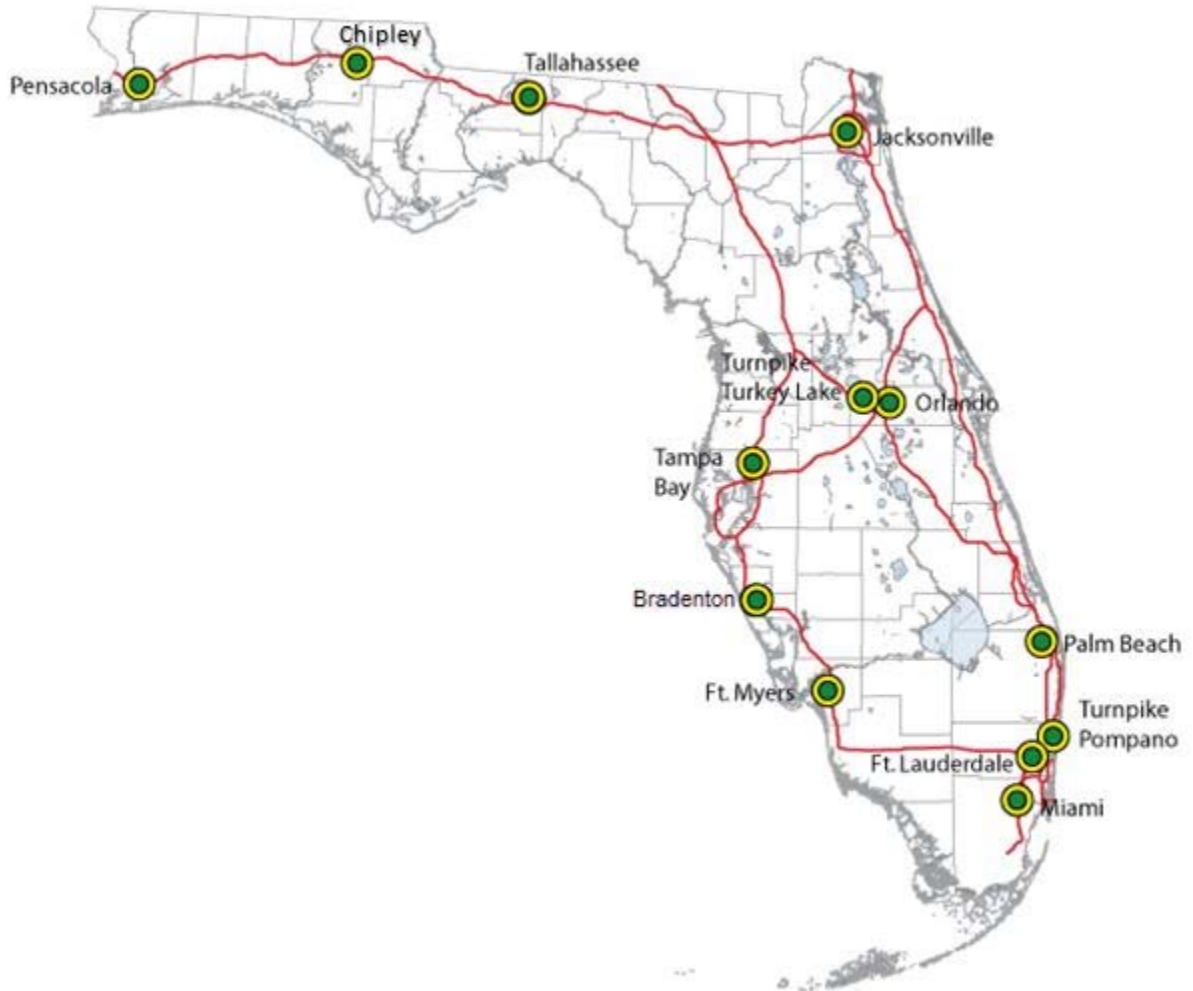
Figure 2: Florida Regional TMCs.

FDOT's RTMCs using the SunGuide software have amply demonstrated the capability of extending operations to include new software. This will require a SunGuide software modification to include a truck parking module to operate TPAS.