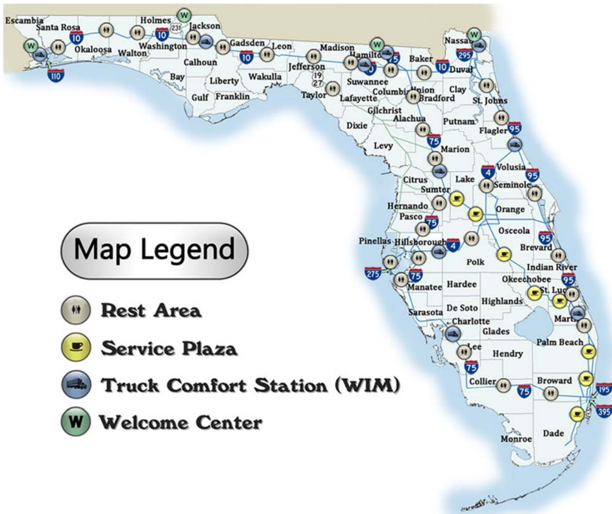
Figure 3: Map of Florida’s Public Rest Areas.